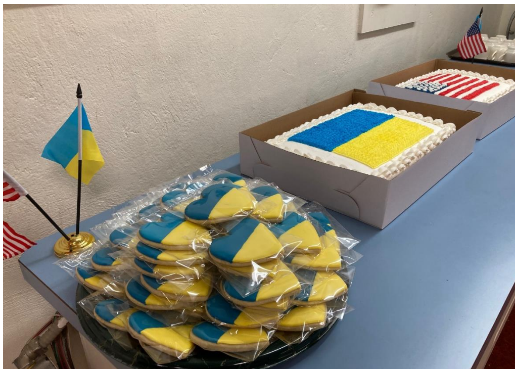
UKRAINIAN FUNDRAISER DINNER